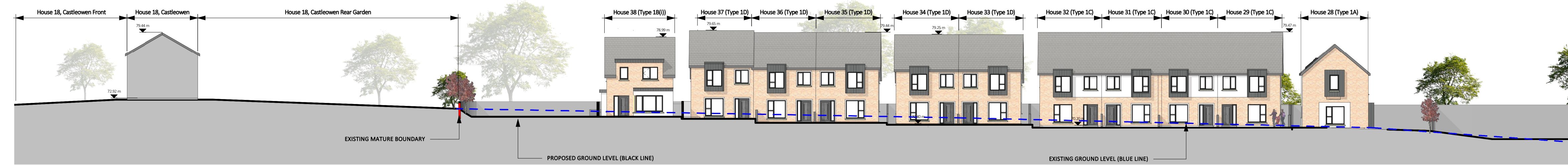
5 Section E 1 : 250