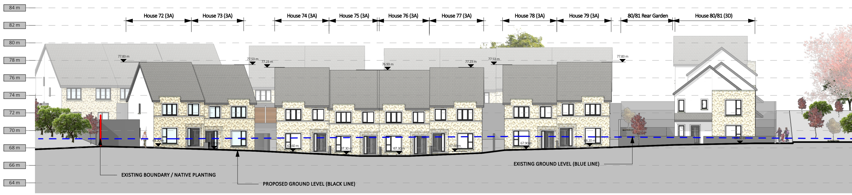
3 Section C 1 : 250