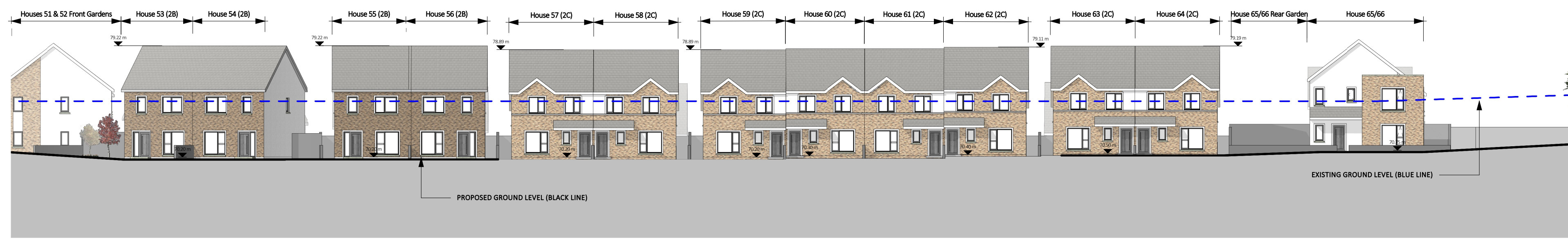
2 Section B 1 : 250